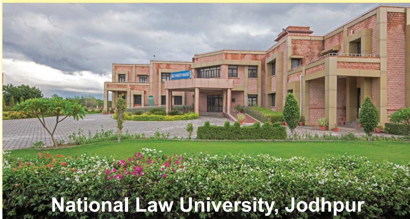
National Law University, Jodhpur